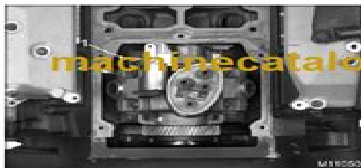
Figure 234 HPFP assembly