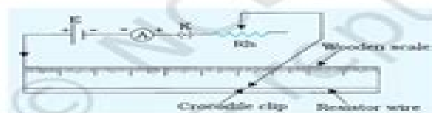
Fig. E 1.3

Note the ammeter reading I by connecting the crocodile clip at 10, 20, 30 ..... cm length of wire. Plot a graph between 1/I and L . Find its slope and interpret its result. Can you use the graph to check the homogeneity of the resistance wire?