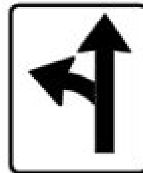
Thru & Left