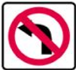
No Left Turn