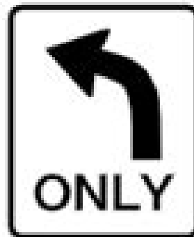
Left Turn Only