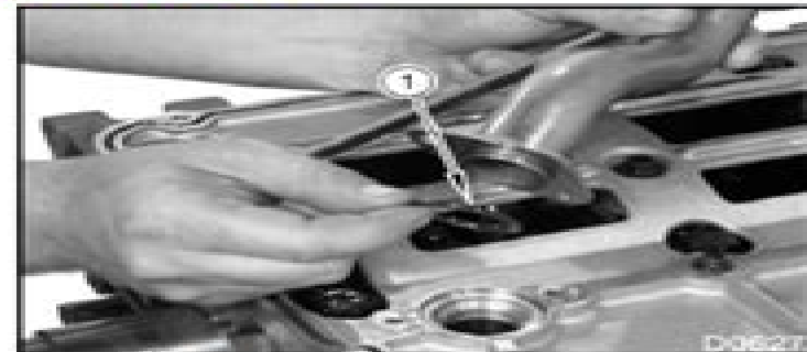
Figure 261 O-ring