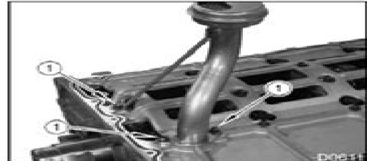
Figure 260 Oil pickup tube