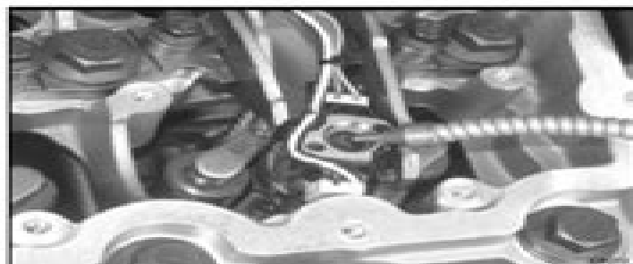
Figure 251 Lubricating top D-ring

CAUTION: To prevent engine damage, be sure injector wiring is clear of all moving parts.