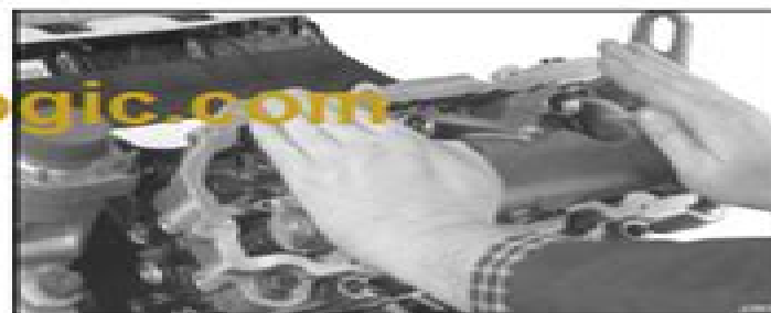
Figure 253 Seating the high-pressure oil rail