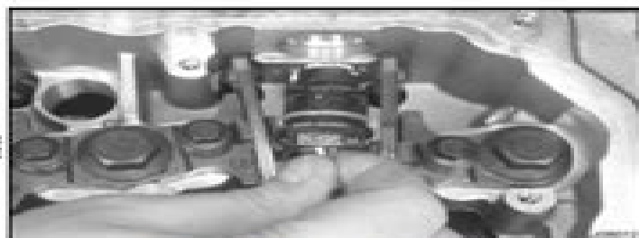
Figure 250 Installing the injector harness connector