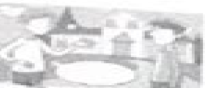
7 This is my house.