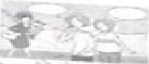
5 Is that a dog?