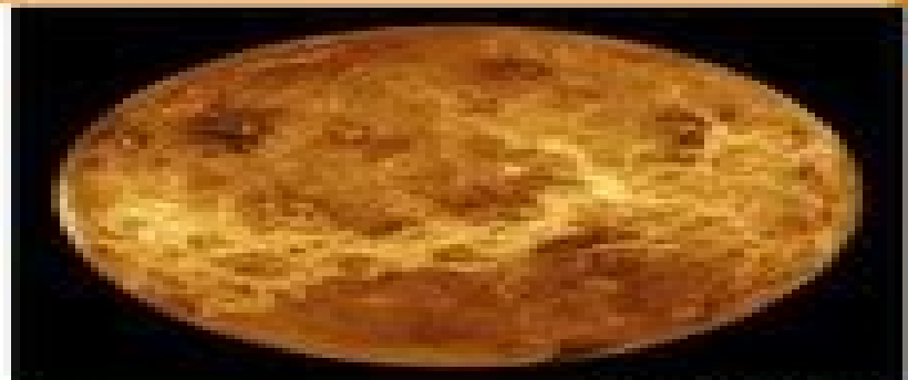
Our Solar System

called Earth's sister planet because of the size, second nearest planet from the sun