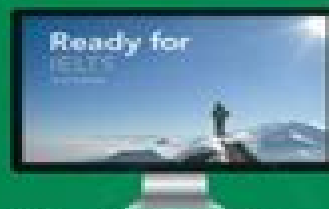
Teacher's Resource Centre with class audio Digital Student's Book eBook