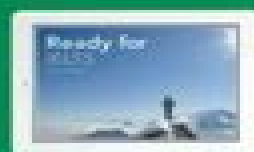
Student's Resource Centre with class audio