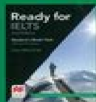
Student's Book and eBook Digital Student's Book