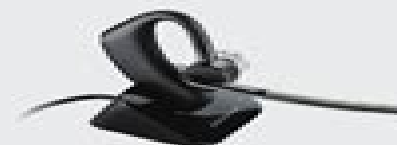
Desktop-charging stand (Optional)