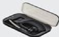
Charging case (Optional)