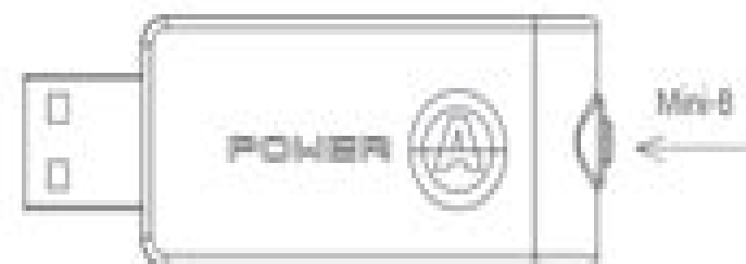
Fig. 3 USB Controller Adaptor / Receiver

L1 - LEFT SHOULDER button L2 - LEFT TRIGGER button