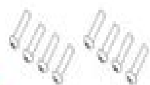
5 Hexagon flat round head screws M5*18 x8