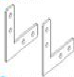
3 L-shaped connecting piece