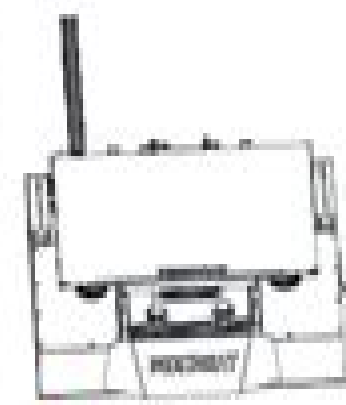
1 Base Frame