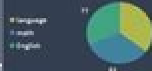
The average score