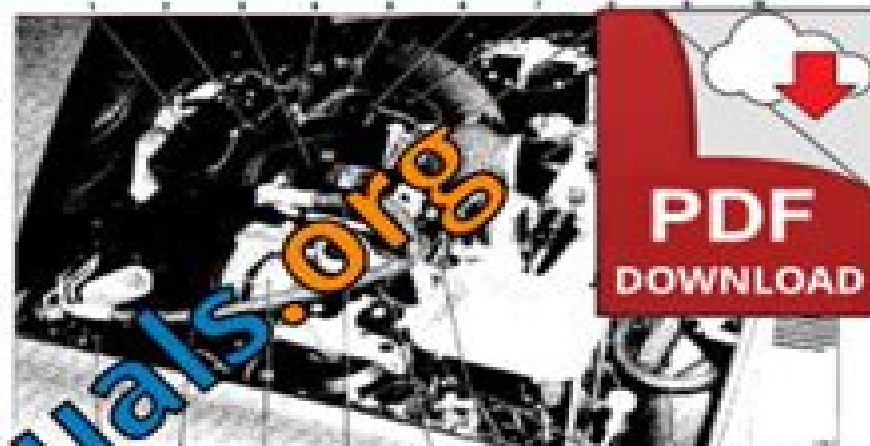
Fig. 10. Normalized value of engine concentration. Note: same

4. The great damage to the coastal zone (bays, lagoons), care should be taken not to concentrate the population in the vicinity of the power stations, leaving some reserves.