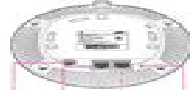
PoE input Ethernet port Console port Reset switch