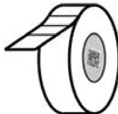
1 Roll 1" Label