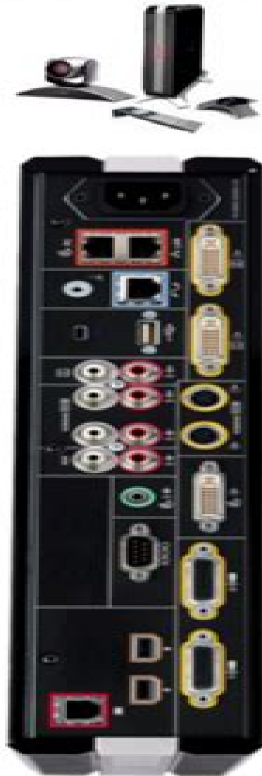
8000 HD Codec