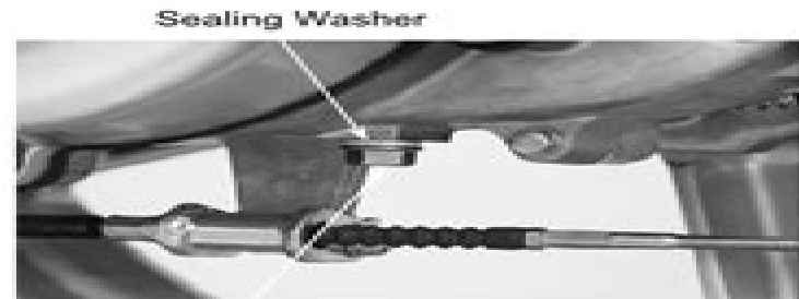
Oil Drain Bolt

Remove the left crankcase cover. (⇨9-3) Inspect the drive belt for cracks or excessive wear. Replace the drive belt with a new one if necessary and in accordance with the Maintenance Schedule.