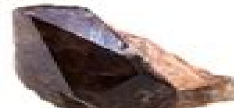
morion (smoky quartz)