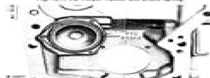
Fig. 13 - PTO Brake

Install rockshaft selector knob and differential lock pedal.