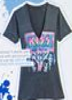
This t-shirt is made of a soft, stretchy fabric that makes it easy to wear. It's also made of a material that's resistant to wear and tear, so it'll last a long time.