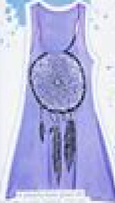
This tunic top is made of a soft, stretchy fabric that makes it easy to wear. It's also made of a material that's resistant to wear and tear, so it'll last a long time.