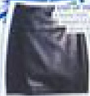
This mini dress is made of a soft, stretchy fabric that makes it easy to wear. It's also made of a material that's resistant to wear and tear, so it'll last a long time.