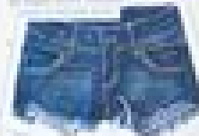
These denim shorts are made of a soft, stretchy fabric that makes them easy to wear. They're also made of a material that's resistant to wear and tear, so they'll last a long time.