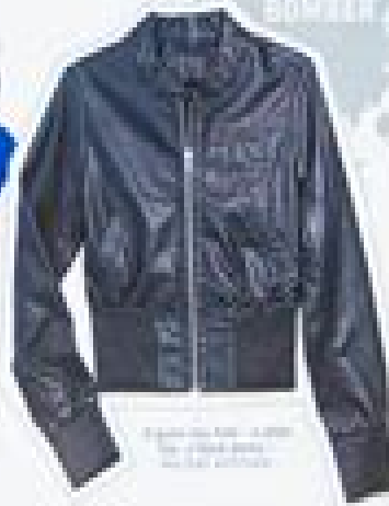
This bomber jacket is made of a soft, stretchy fabric that makes it easy to wear. It's also made of a material that's resistant to wear and tear, so it'll last a long time.