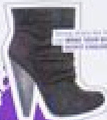
These boots are made of a soft, stretchy fabric that makes them easy to wear. They're also made of a material that's resistant to wear and tear, so they'll last a long time.