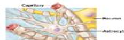
(a) Astrocytes are the most abundant CNS neuroglia.