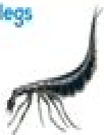
Water beetle larva