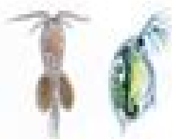
Water fleas (hydra and daphnia)