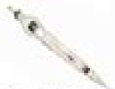
Phantom midge larva