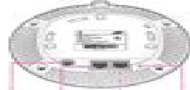
PoE input Ethernet port Console port Reset switch