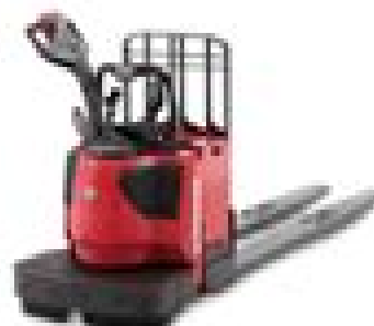
Figure 3-3 Model 3310 with Electric PowerSteer