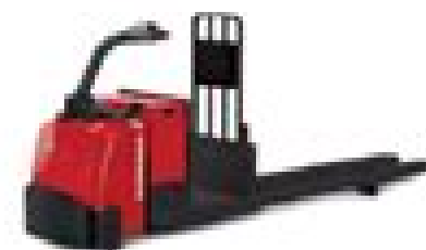
Figure 3-5 Model 3410 with Electric PowerSteer