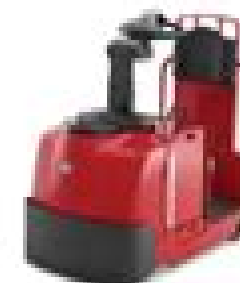
Figure 3-6 Model 3410 with Springloaded Handle