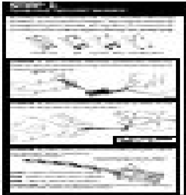
Figure 6: Relationship between the number of people (N) and the number of people (N). The graph shows a curve that starts at the origin and increases, leveling off as N increases. This indicates that the number of people (N) is a function of the number of people (N).

Figure 4: Relationship between the number of people (N) and the number of people (N). The graph shows a curve that starts at the origin and increases, leveling off as N increases. This indicates that the number of people (N) is a function of the number of people (N).