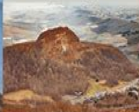
Showa Shinjan, Japan