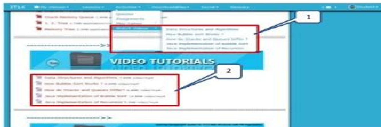
Figure 20. Watching a Video File