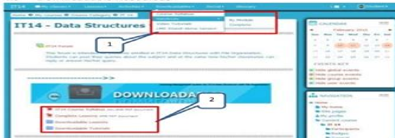
Figure 21. Downloadable resources