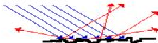
A dry asphalt roadway diffuses incident light.