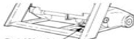
Serial Number Decal