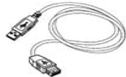
Micro USB cable*