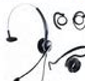
Jabra GN 2100