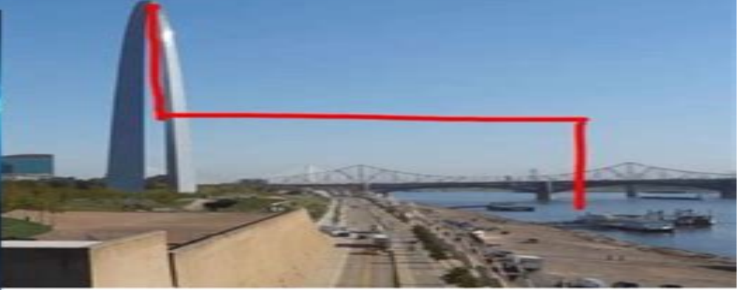
PERCY JACKSON CORE