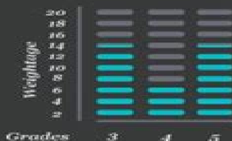
Measurement and Data (MD)