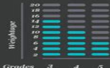
Operations and Algebraic Thinking (OA)