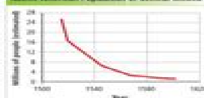
Native American Population of Central Mexico