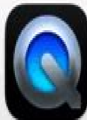
Table of Contents ⓘ