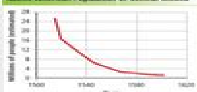
Native American Population of Central Mexico