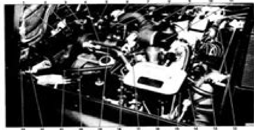
Fig. 103 General view of engine compartment. Note the