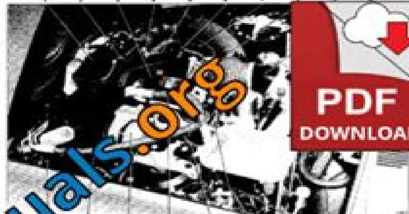
Fig. 10. Nominal value of engine components. (Note: see text.)

18. The present changes in the central credit banks (banks), now should be taken into account in strengthening the paper in the system on the paper account showing the present situation.