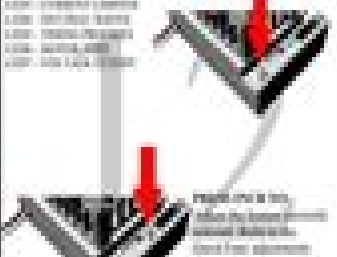
FIGURE 4: Quick Tune

The RX3 GEN2 receiver unit is designed to be installed in a location that provides adequate ventilation. The fan installation is a critical part of the receiver unit's operation. The fan should be installed and the fan should be connected to the receiver unit's power supply.