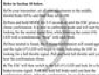
FIGURE 3: Radio Calibration

The RX3 GEN2 receiver unit is designed to be installed in a location that provides adequate ventilation. The fan installation is a critical part of the receiver unit's operation. The fan should be installed and the fan should be connected to the receiver unit's power supply.