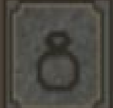
Best F2P Melee Armour