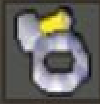
Best P2P Strength Armour