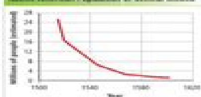
Native American Population of Central Mexico