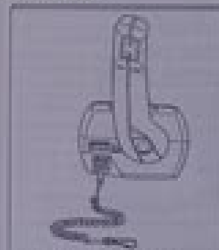
COMMANDER 3000 PANEL MOUNT REMOTE CONTROL