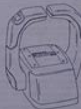
COMMANDER 3000 DUAL HANDLE CONSOLE MOUNT REMOTE CONTROL