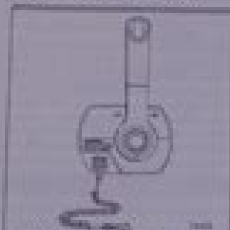
COMMANDER 3000 CLASSIC PANEL MOUNT REMOTE CONTROL