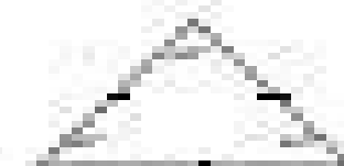
Equilateral triangle Equilateral triangle

A regular polygon is a polygon in which all sides are congruent and all angles are congruent.