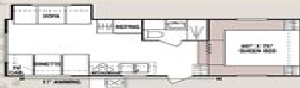
2353P-F - UVW 5460 - Dry Hsch Wt. 1100 - NOC 1540 - Length 25'1"