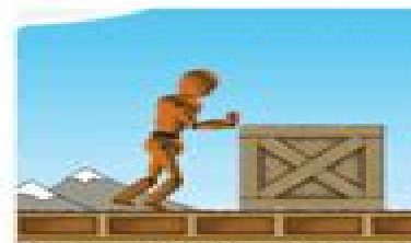
Sam pushing and box moving

b. Check your sketches using the sim and make corrections if needed. List any new ideas you discovered.