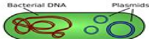
Figure 3 Genetic material in bacteria takes 2 forms.

Bacterial evolution and adaptation in the wild often occur via plasmid transfers from one bacterium to another. An example of bacterial adaptation is resistance to antibiotics via the transmission of plasmids. This natural process can be modified by humans to increase our quality of life. In agriculture, genes are added to help plants survive difficult climatic conditions or damage from insects, and to increase their absorption of nutrients. Toxic chemical spills can often be bioremediated (cleaned-up) by transformed bacteria specifically engineered to do the task. Currently, many people with diabetes rely on insulin made from bacteria transformed with the human insulin gene. Scientists use transformation as a tool to study and manipulate genes all the time.