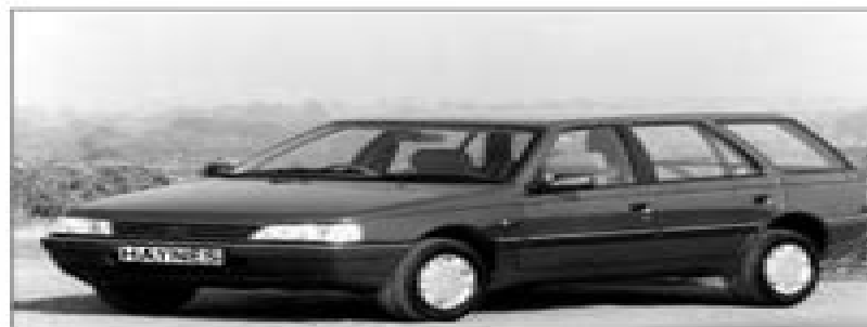
Peugeot 405 GL Estate