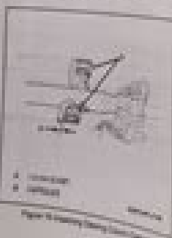
Figure 25.4.1.1. Checking Steering Column Damage