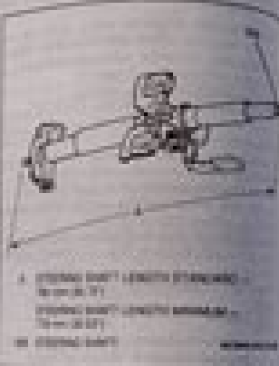
Figure 25.5.1.1. Measuring Steering Wheel