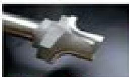
High grade PCD