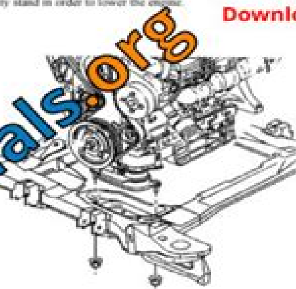
Fig. 31: Identifying Engine Mount Lower Nuts

Install the existing exterior house vents.